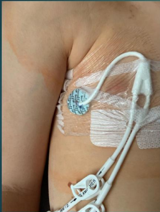
What is a Hickman Line?